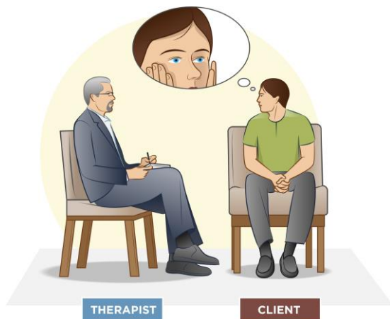
Fig. 2 Identifying and acknowledging the associated feelings.

6. Once the client is visualizing the peak moment of his sexual fantasy and allowing himself to intensely experience its associated emotion, ask the client to imagine taking a stance of being outside of himself in the third person and look deeply and directly into his own eyes and notice what he sees (Figure 2).