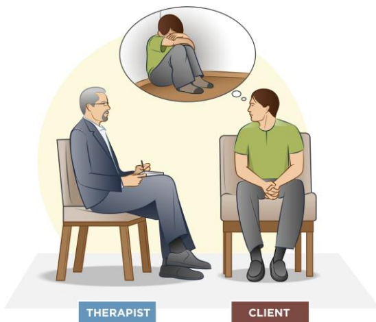
Fig. 4 Associating back to historical experiences.

"I'm alone on the playground, and everyone is ignoring me." Or, "I remember my mom shouting at me, and I was afraid of her."