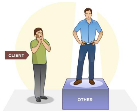
Fig. 1 Examining activating event.

4. Identify the specific element of the target behavior that has the most emotional intensity associated with it. For sexual behaviors, this would be the peak moment of the client's most powerful sexual fantasy (Figure 1).