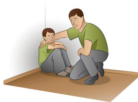
Fig. 5 Feeling and expressing self-compassion.

8. Once the client has identified the earlier trauma memory, begin to resolve it using mindful self-compassion. At this point, the therapist asks the client, who is still in the third-person observer state, to access feelings within himself of compassion toward his younger self (Figure 5):